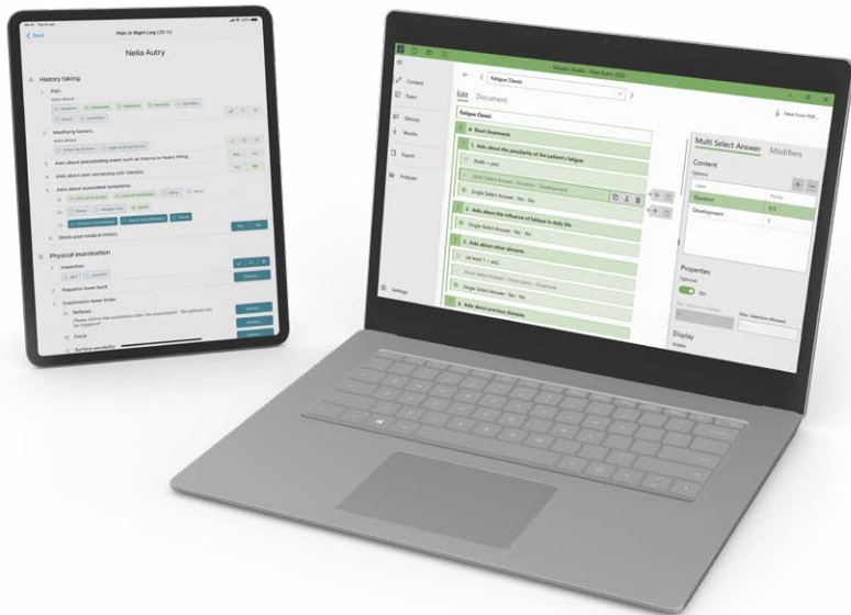
Valuatic Studio and Valuatic Touch applications